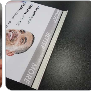
Line up graphic with rail.