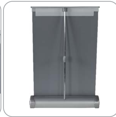
Unit is complete. Back view.