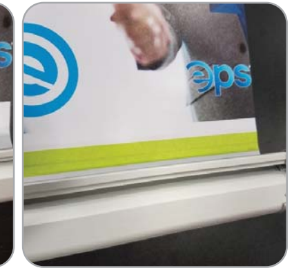
Apply tape to the bottom front of the graphic for extra re-enforcement.