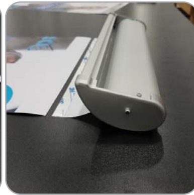
Have banner stand upside down. This keeps leader strip from curling up.