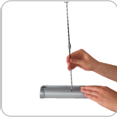
Secure pole to base of stand.