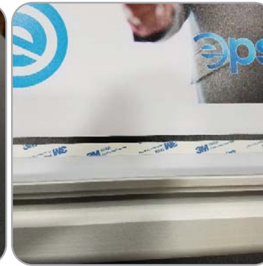
Line up graphic with leader strip.