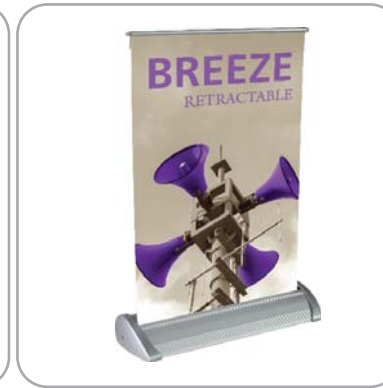
Unit is complete.