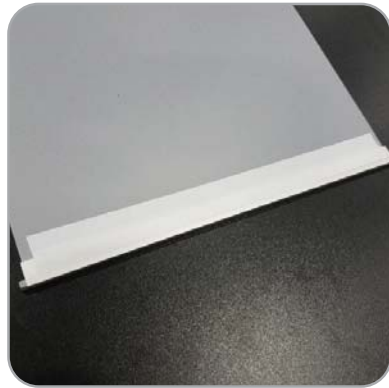
Take the re-enforcing tape and apply to the back of the banner and rail making sure there is even coverage between the two.