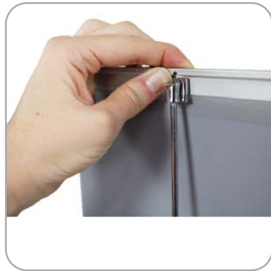
Pull up graphic and secure to poles.