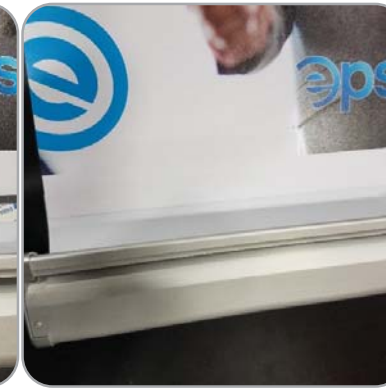
Mount graphic to leader strip evenly making sure there is one 1/2" of overlap.