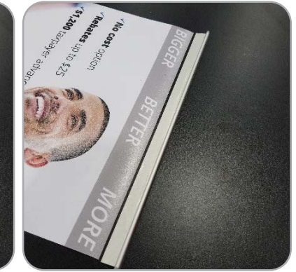
Apply graphic so that its even on both sides.