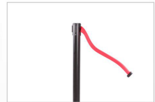
Brake for slow and safe belt retraction