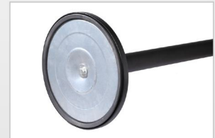
Full circumference floor protector