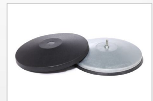
Concrete filled galvanized steel base